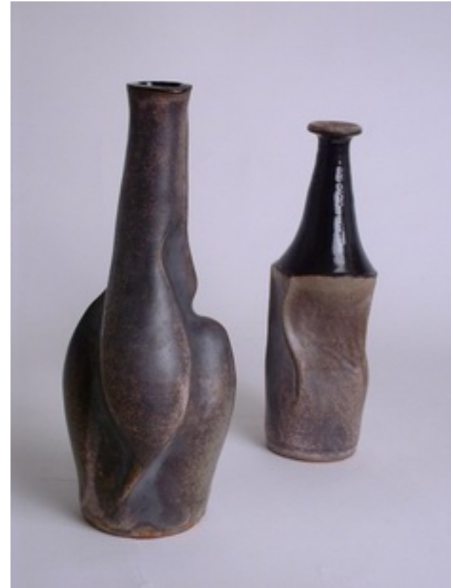
Two ceramic vases by Dahlia Kaufman 10"x3", 11"x4"